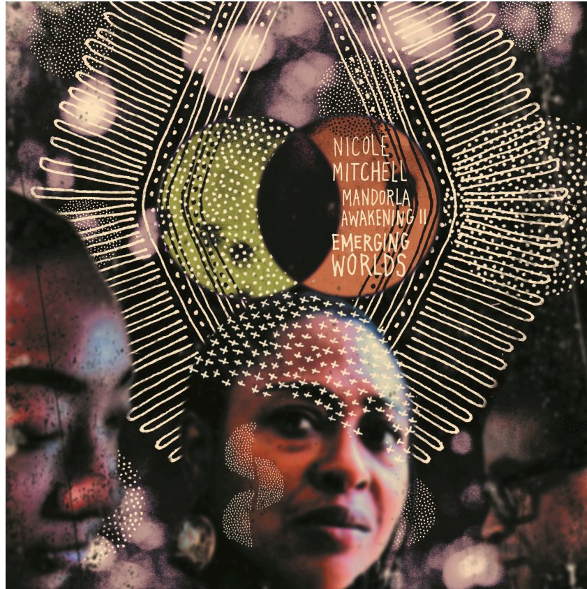
Figure 1.3. Album cover for Mandorla Awakening II: Emerging Worlds (2017), featuring mandorla image.

( https://www.fperecs.com/catalog/mandorla-awakening-ii-emerging-worlds/ )